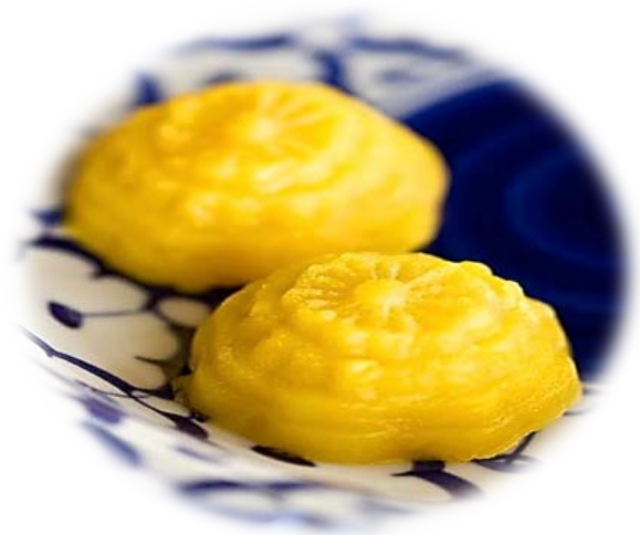
Fig.6 Ja Mong Gut