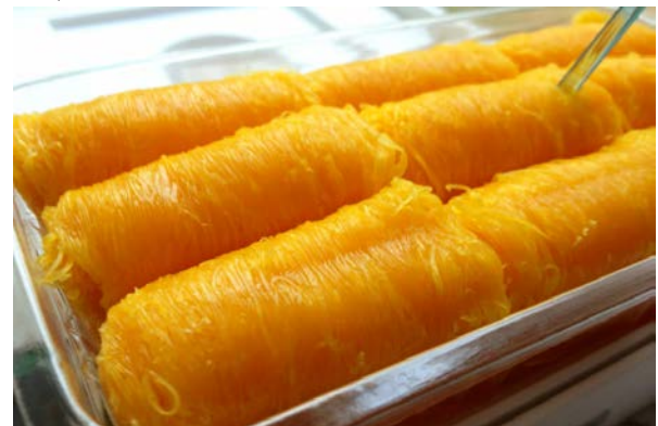
Fig. 1 Foy Tong (Sweet Shredded Egg Yolk)

they are small soft colorful Thai dessert but auspicious desserts are made from pure egg yolks. When they are cooked, they become golden soft desserts. They will be used for various occasion such as Thai wedding, auspicious festivals, making merit, Thai Buddhism rituals, etc. which are related to Thai way of lives. Thai desserts are the most popular for various auspicious events. Because Thai people believe that golden color stands for an auspicious meaning to their lives. Their making merit use Thai desserts for the ceremonies. The auspicious Thai desserts are delicious golden desserts which are various meaning such as meaning to be successful, prosperous, and wealthy. Each Thai dessert has its meaning which is a different meaning such as Tong Yip means whatever you touch or pick up, it is turned to wealth and Thong Ake means a good one in life. It is meaningful for bride and groom because it means faithful. This reason, the English language communication becomes very important at Amphawa Floating Market in Samut Songkram province for tourism. Studying the identities of Cultural Art: Thai Desserts in the English language made foreign tourists understand the identity of Cultural Art: Thai Desserts in Thailand better for visiting at Amphawa Floating Market in Samut Songkram province, Thailand.