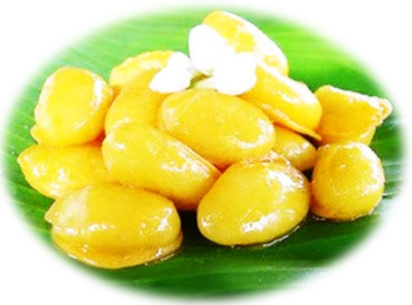
Fig. 4 Med Khanun (Thai green peanut paste)