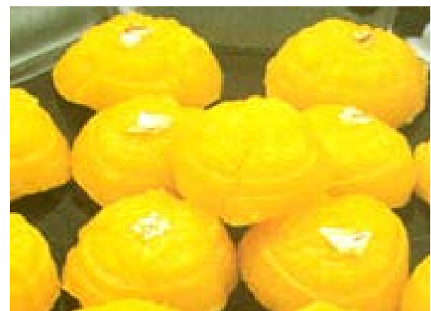
Fig. 2 Tong Ake