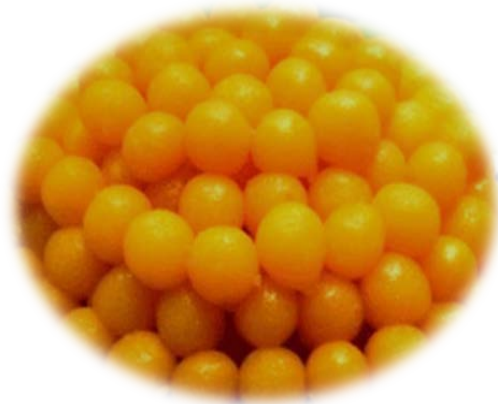
Fig. 7 Thong Yod (Gold Egg Yolks Drops)