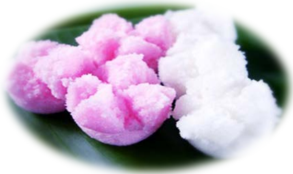
Fig. 9 Tuay Fu