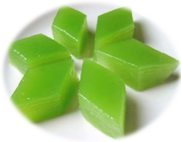
Fig. 3 Khanom Chun (Layered Dessert)