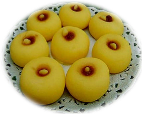
Fig. 10 Sanay Chan