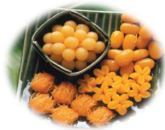
Fig. 8 Thai desserts: Foy Thong, Thong Yip, Thong Yod and Med Khanun