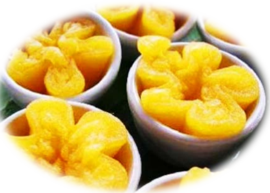
Fig. 5 Thong Yip